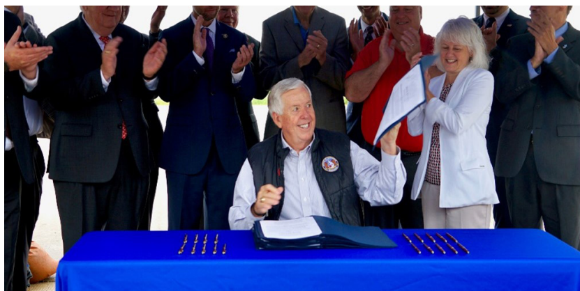
Industry partners and MoDOT joined Governor Parson and other elected officials in a ceremonial budget bill signing in St. Charles County on August 14, 2023.

The tentative schedule for the Improve I-70 project has been released to industry partners and the public. Early projects for the schedule were based on locations where a significant amount of early work had already been completed.